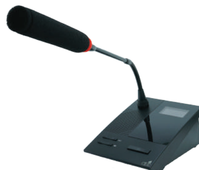
DM100 Delegate Unit

CM100 is a Chairman unit which has control over other delegates, i.e. higher priority talk and cancel feature. It comes with 2m extension cable for connectivity to the next delegate unit. It has built in speaker with digital volume controller and illuminated gooseneck microphone.