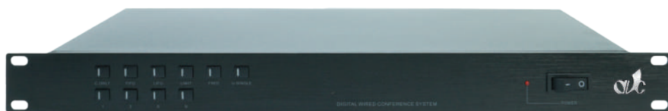
CU100 Controller / PSU