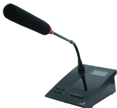
CM100 Chairman Unit